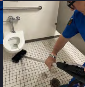
Recover Soil & Dry Floor