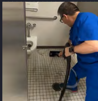
Apply Solution & Scrub